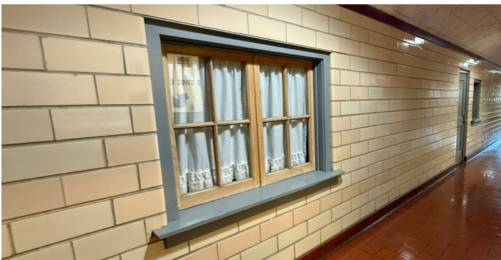
Nonfunctional concession window from original structure