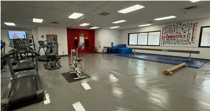
Fitness center/gymnastics space