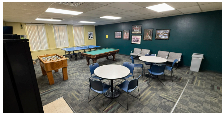
Multifunctional game room