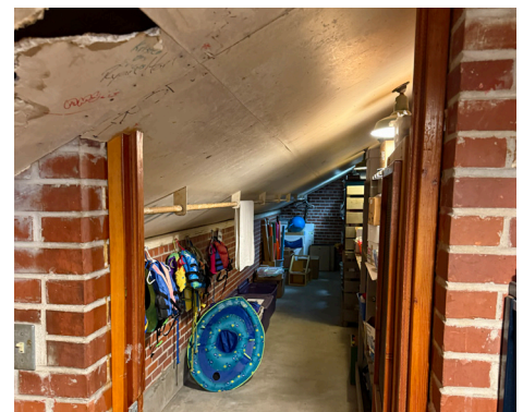
Small storage space (hole in ceiling)

Investing in facilities that support safety, service, and community.